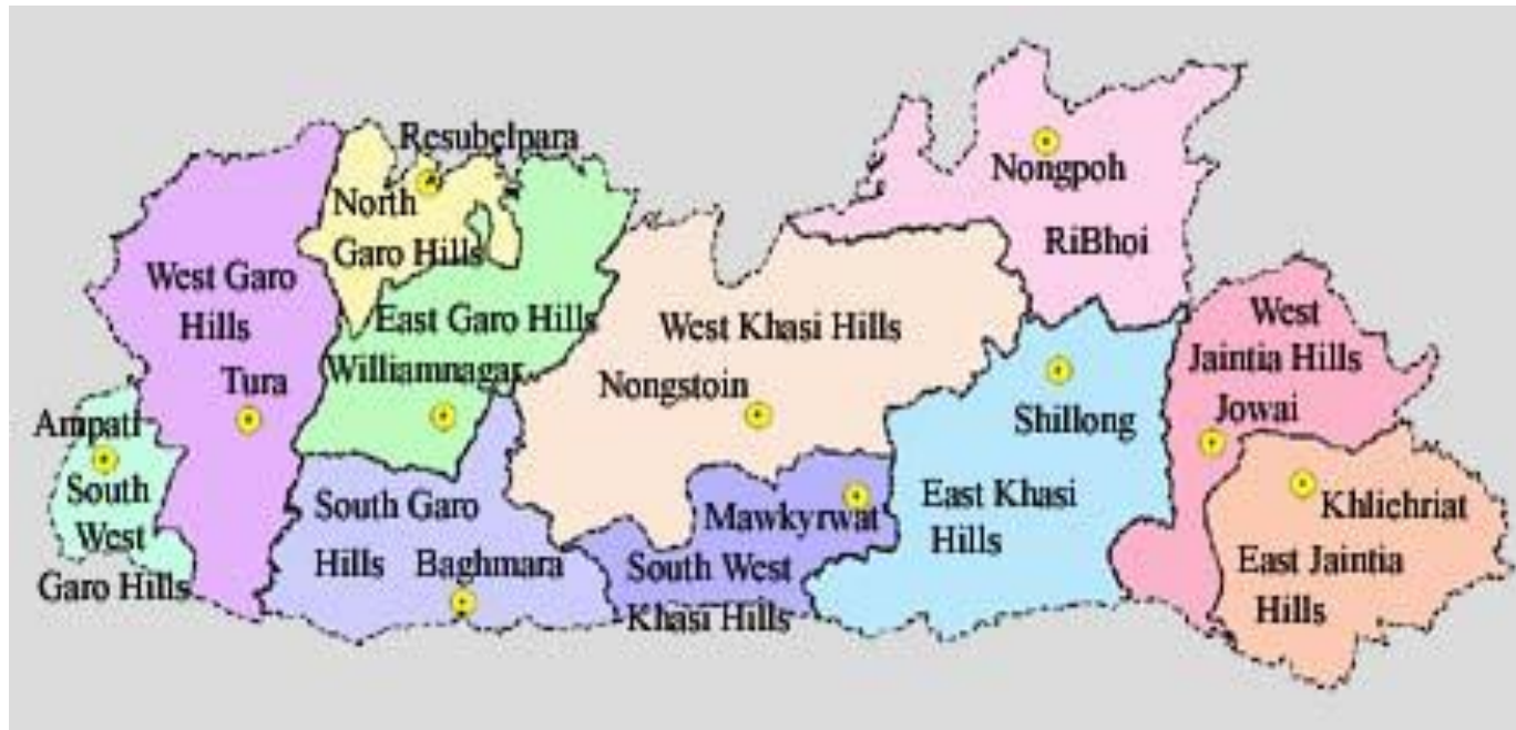
Location map of South Garo Hills district Annexure I