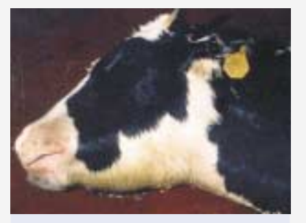
Haemorragic septecaemia affected cow