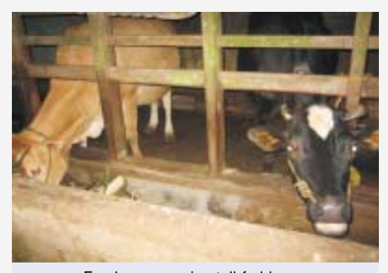
Feed manager in stall fed barns

U-shaped drain with 0.20 m width on either side of the central passage should be provided