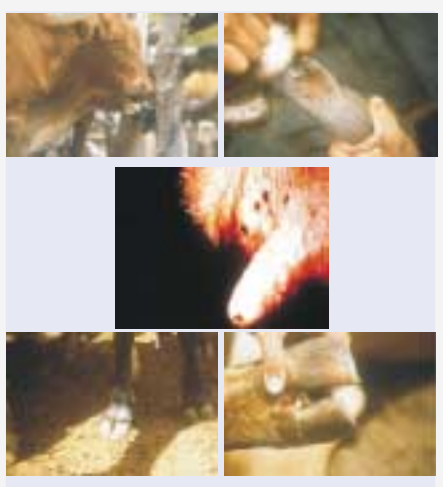
Foot & Mouth Disease symptoms