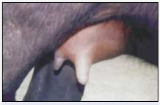
Mastitis affected udder