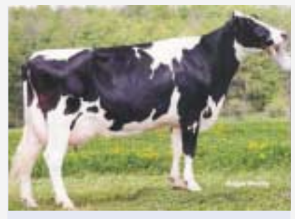
Holstein Fresion cow

This breed can perform well in coastal and delta areas where fodder may not be a problem.