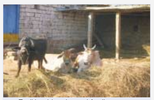
Traditional housing and feeding system

The basic aim of housing is to protect from extreme climatic conditions in order to reduce the "environmental stress" on the animals. The cattle-shed need not be too expensive. When designing them consideration must be given to the comfort and health of animals, the economic use of