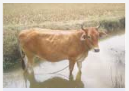
Drinking of stagnated water is a source of internal parasitic infestation